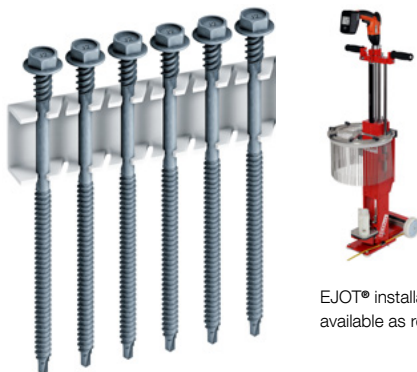
EJOT® installation tool ECOSET available as rental equipment.

Stress plate HTV 82/40 Stress plate HTE 82/40 Stress plate HTV 82/40 F Flat roof profile FP Installation tool ECOSET Socket wrench insert